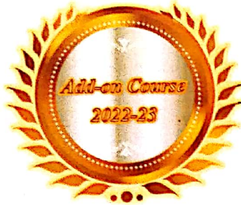
Principal Katwa College

He / She has achieved grade - 'A+' in the final / course end examination held in June 2023.